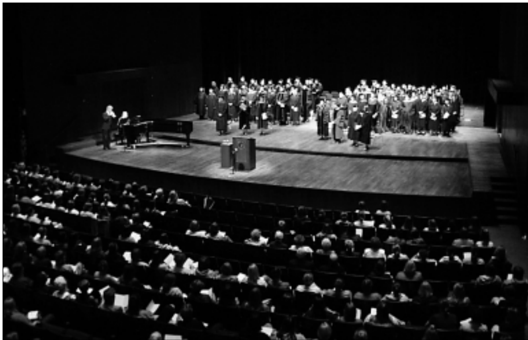
Faculty, staff and students welcome the new academic year at CSB Convocation.

prayer, its relationship to lectio divina (praying with Scripture) and its effects on our lives. It is beneficial to attend all of the sessions.